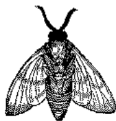
Figure 2: A sample black and white graphic (.eps format) that has been resized with the epsfig command.

single-column table, this wide table will “float” to a location deemed more desirable. Immediately following this sentence is the point at which Table 2 is included in the input file; again, it is instructive to compare the placement of the table here with the table in the printed dvi output of this document.